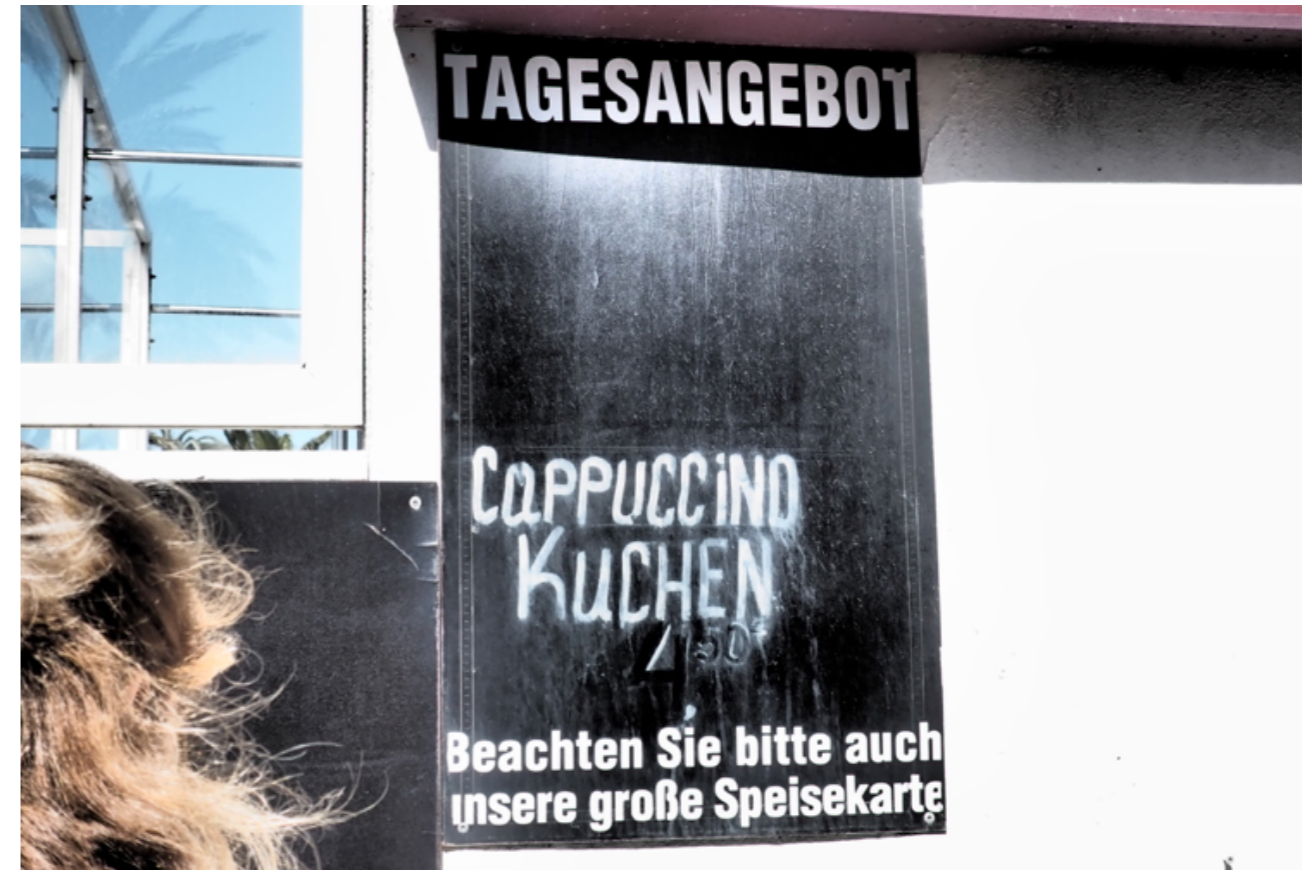
Yes! (A. Mietzner 2017)