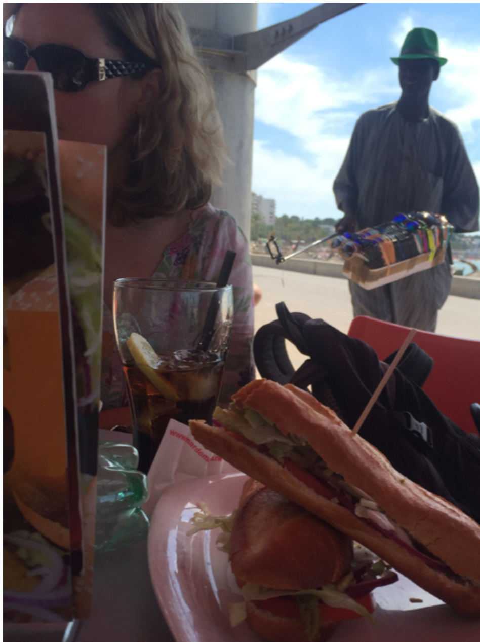
Still life with baguette and vendor (N. Nassenstein 2016)