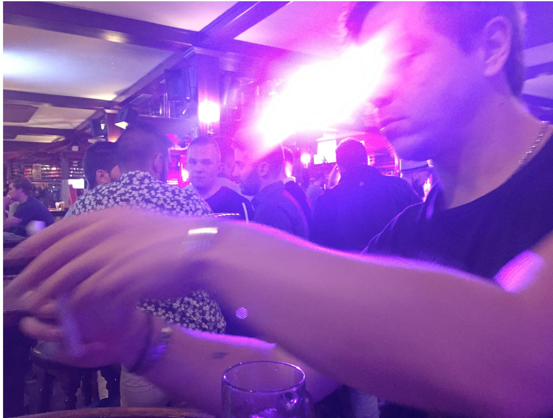
Collecting data in the drinking halls with tourist interactions (J. Traber 2017)