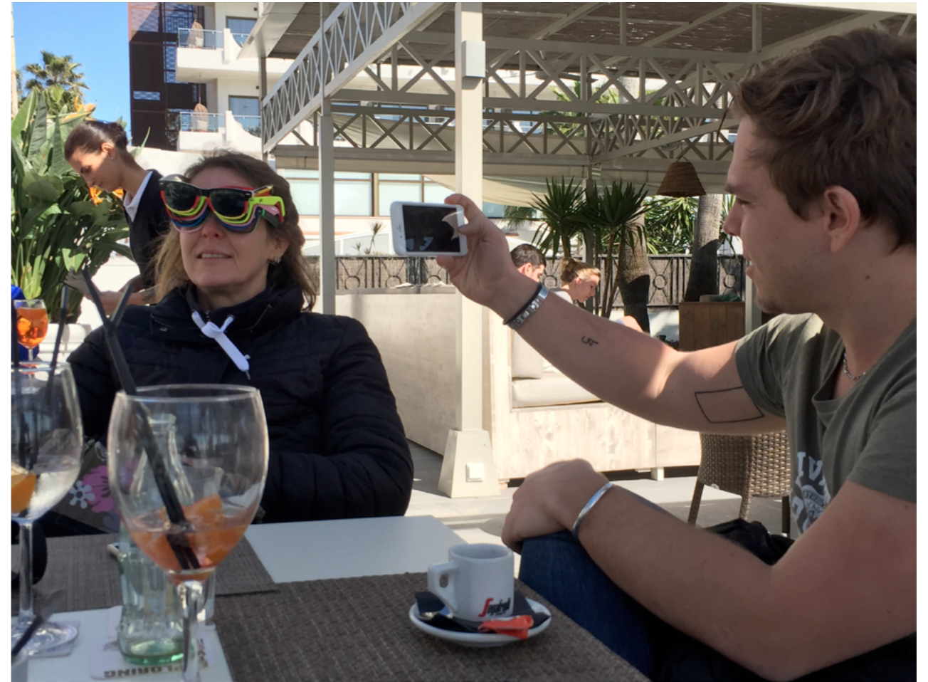
Interactions (J. Traber 2017)