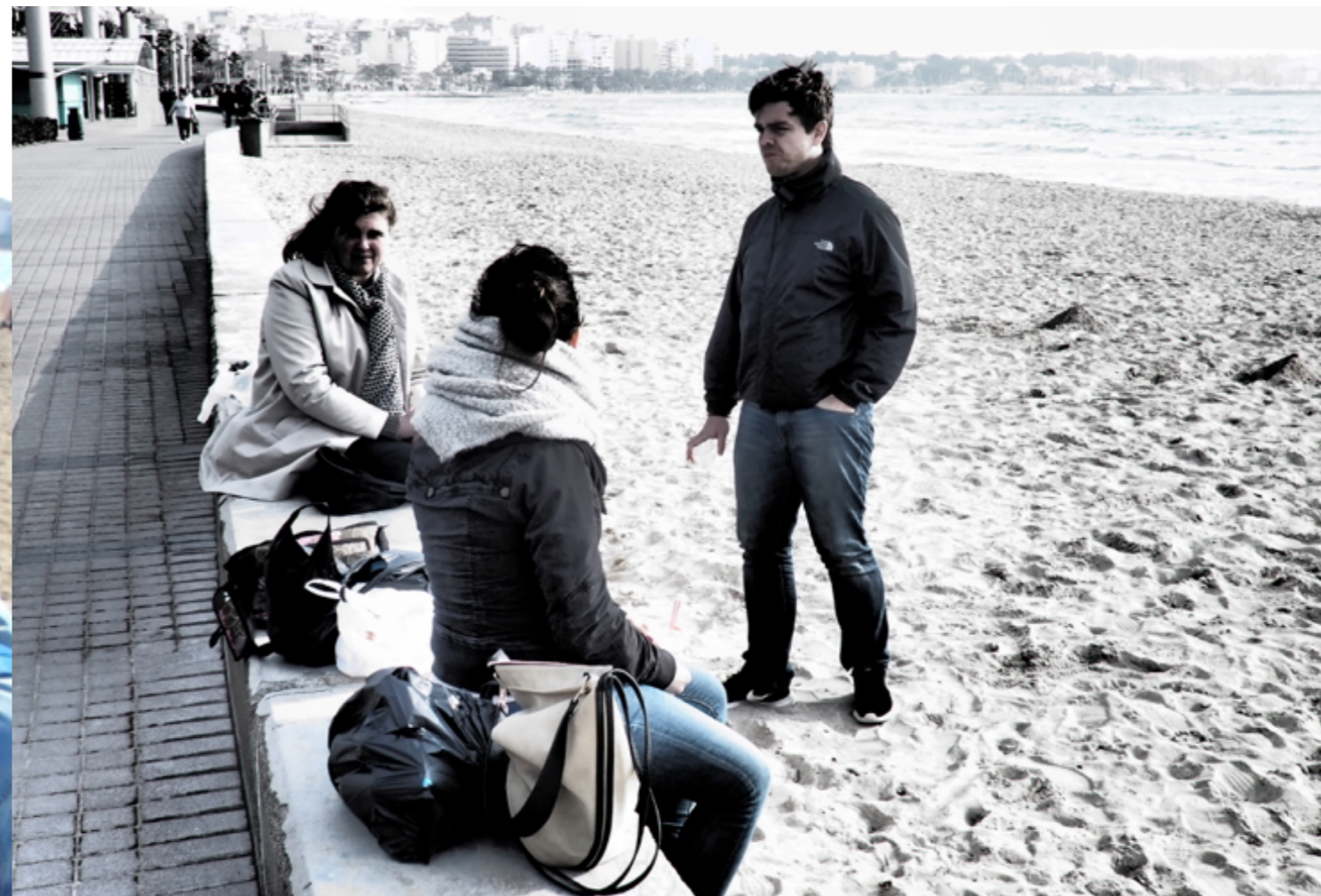
Now what? (A. Mietzner 2017)