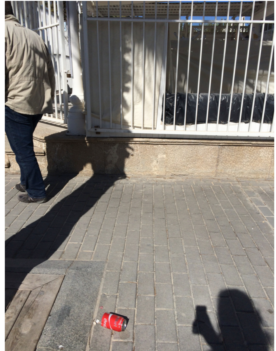
Man, can, me (A. Storch 2017)