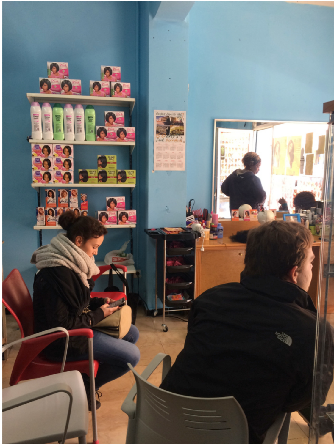
Mirror II (A. Storch 2017)