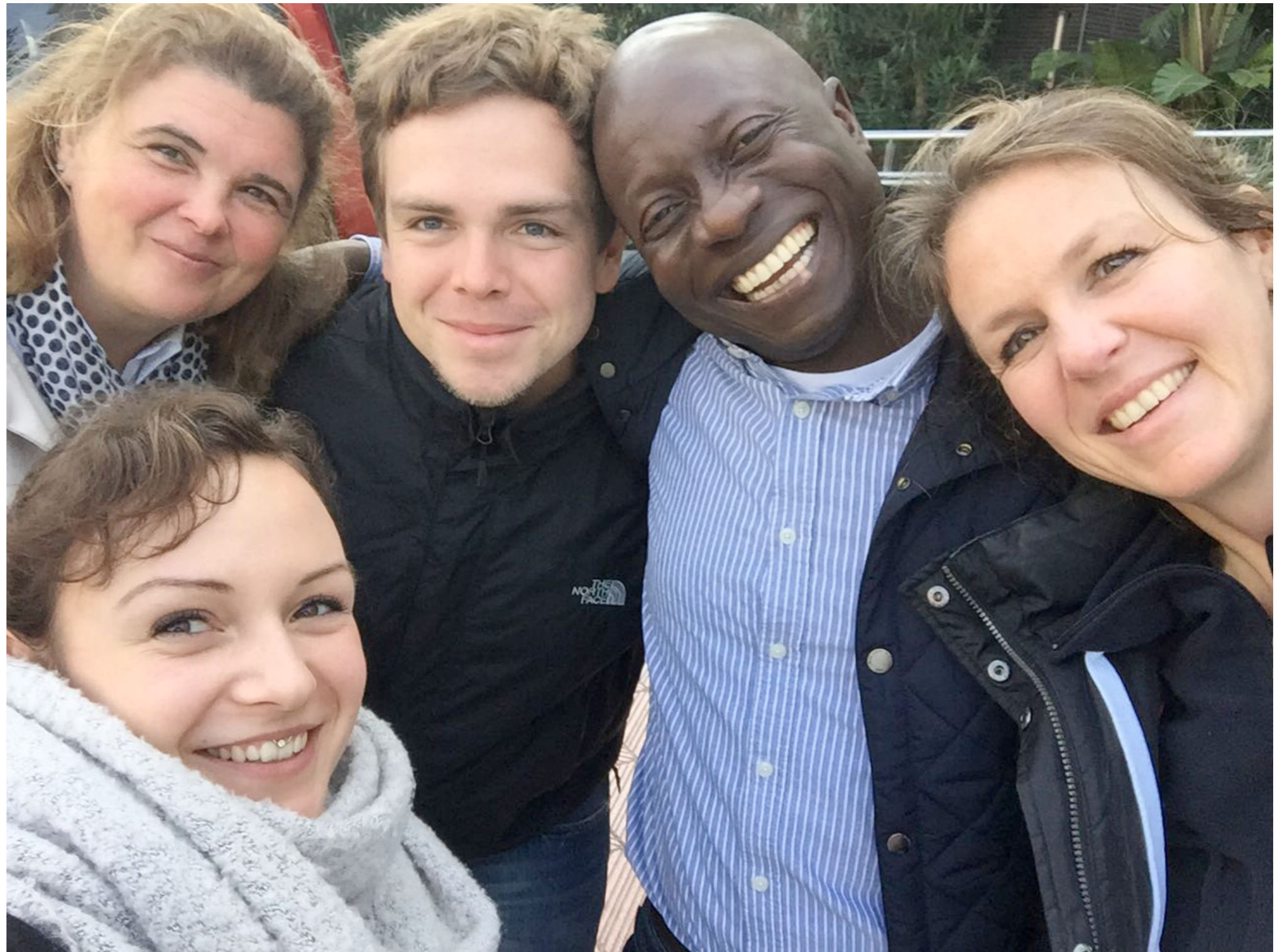
Untitled (J. Traber 2017)