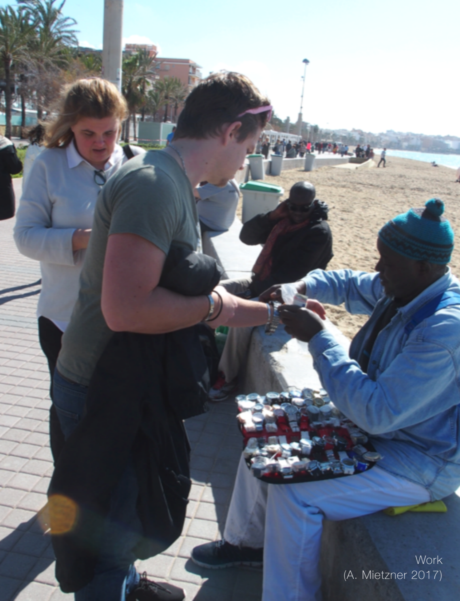
Work (A. Mietzner 2017)