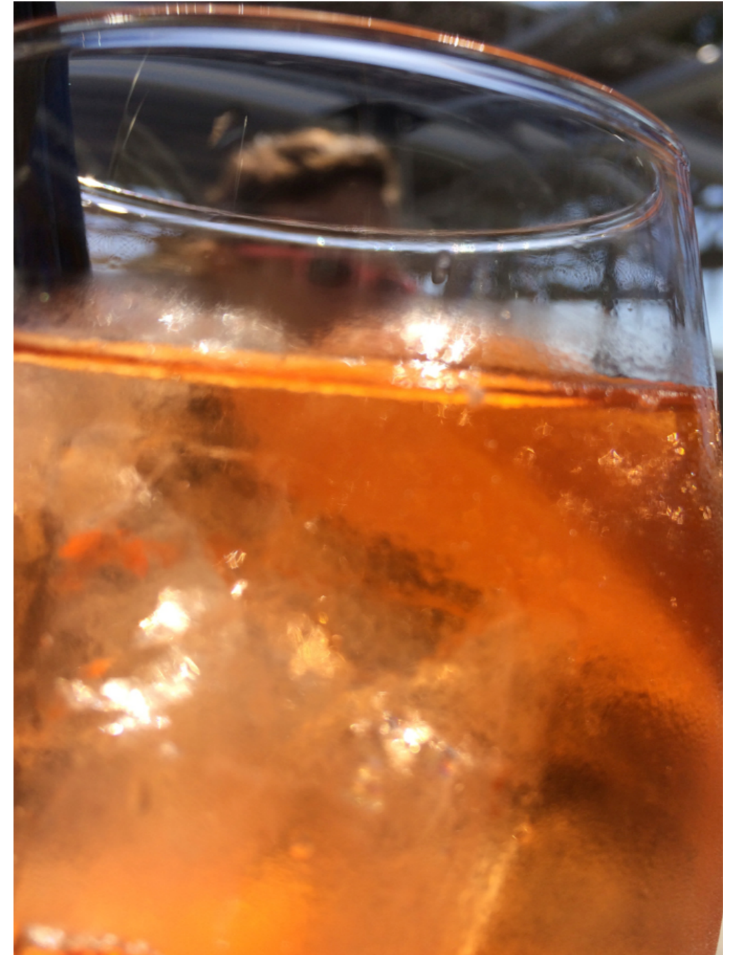
Team filter (A. Storch 2017)