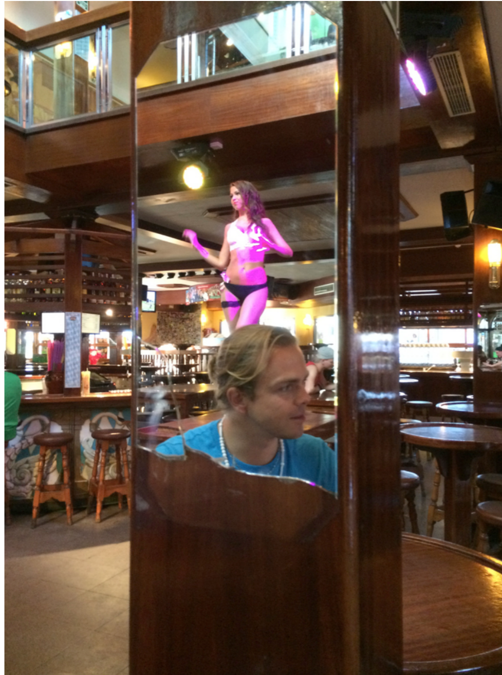
Mirror I (A. Storch 2016)