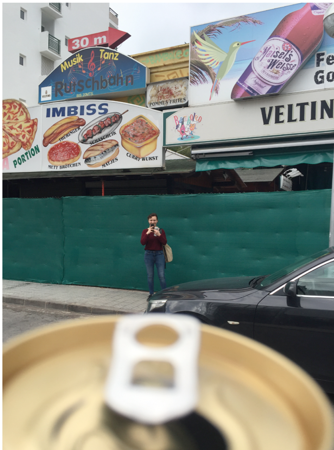
Mutual snapshots, hiding behind cans (N. Nassenstein 2017)