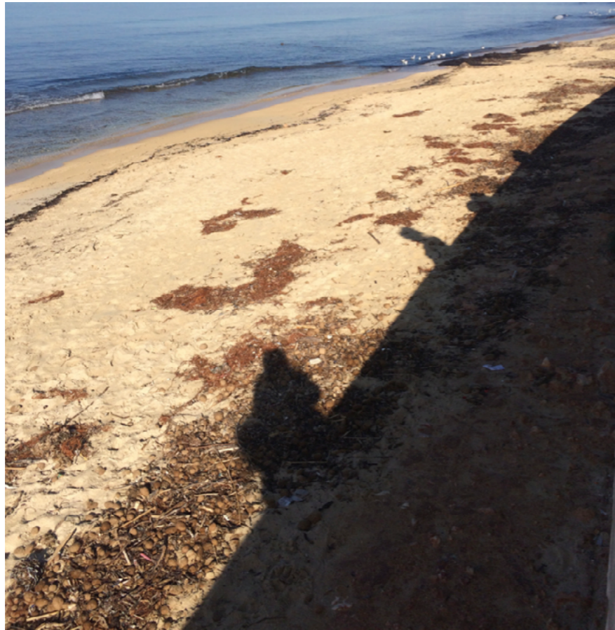
Team on beach (A. Storch 2017)