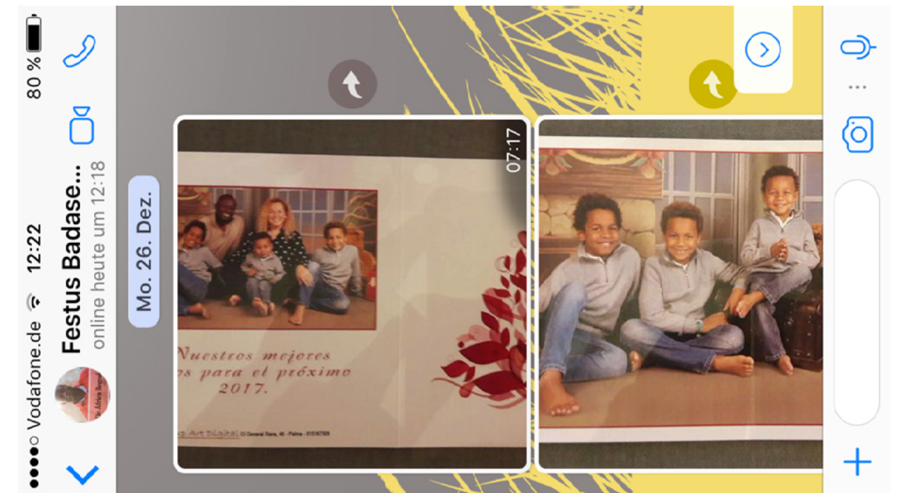
Christmas greetings (A. Storch, screenshot 2016)