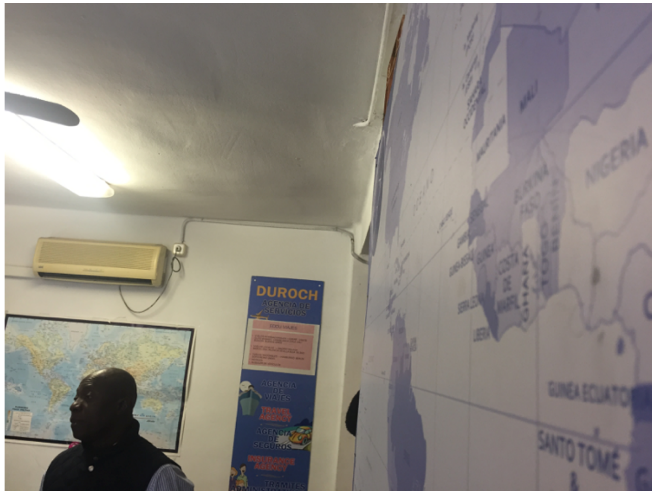
Stories and trajectories in a Nigerian travel agency (N. Nassenstein 2017)