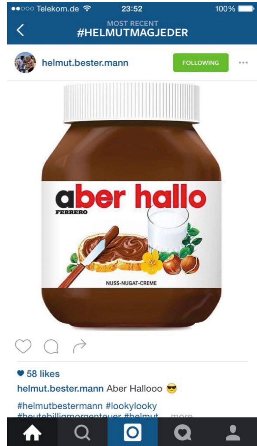
Helmut in a glass (N. Nassenstein, screenshot 2016)