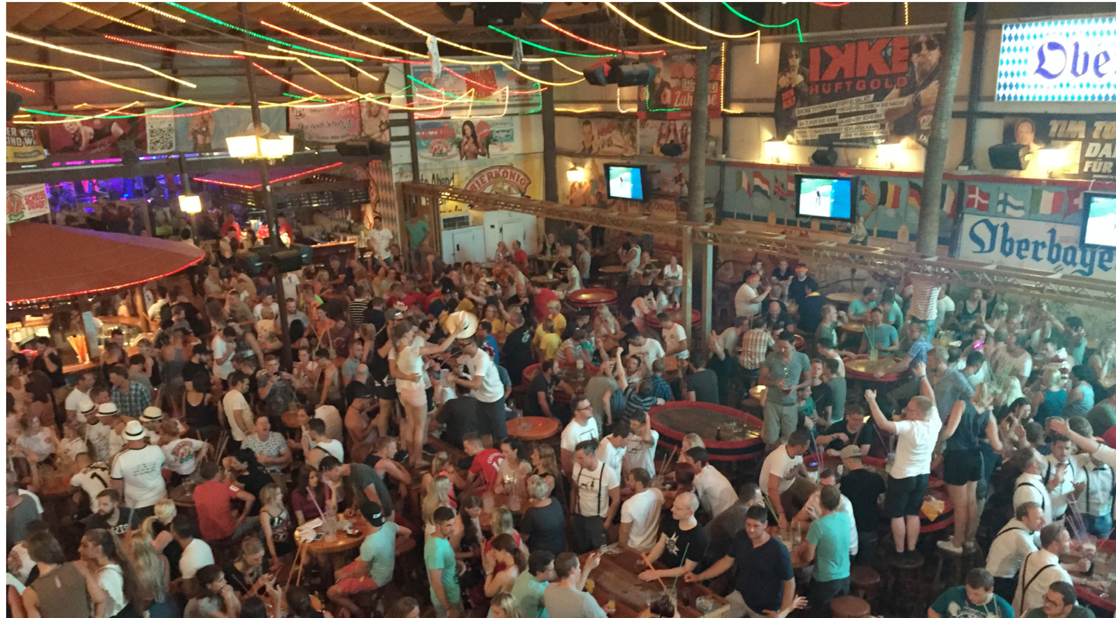
Bierkönig (N. Nassenstein 2016)