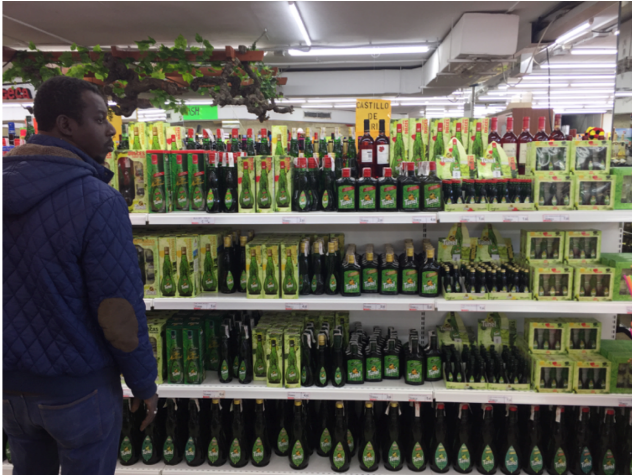
Hierbas, local brew (N. Nassenstein 2017)