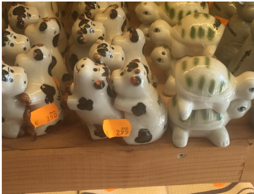
Pepper and salt dispensers in a souvenir shop (J. Traber 2016)