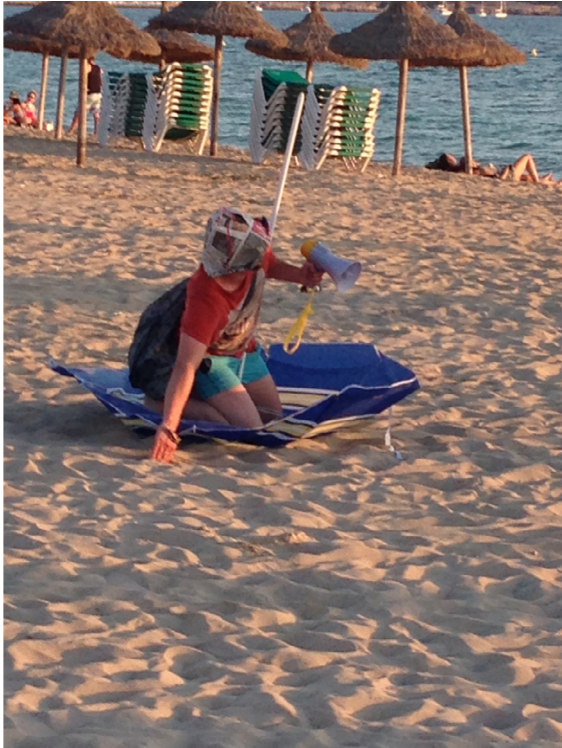
Don't drown! (A. Mietzner 2017)