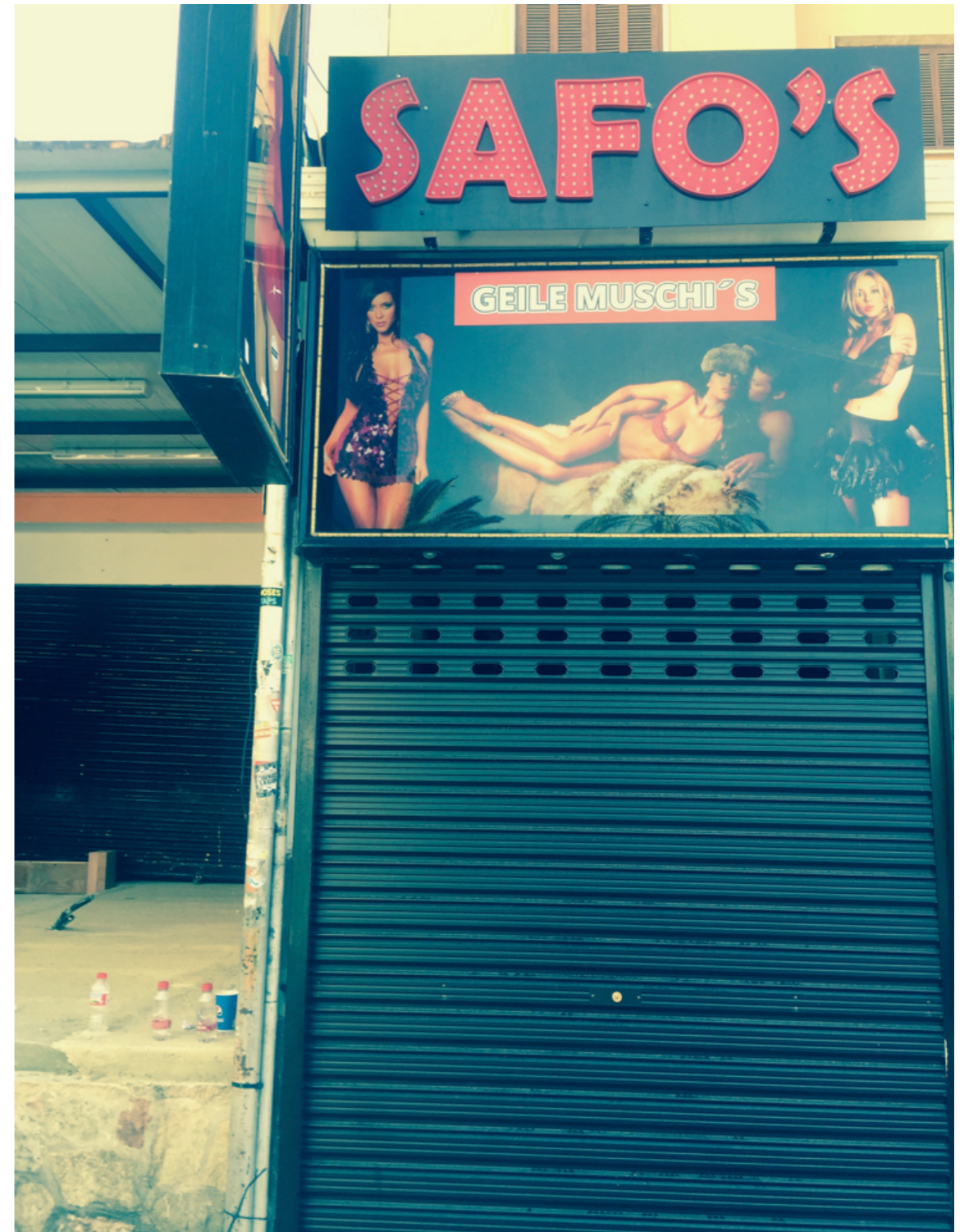
Closed muschi's (N. Nassenstein 2017)