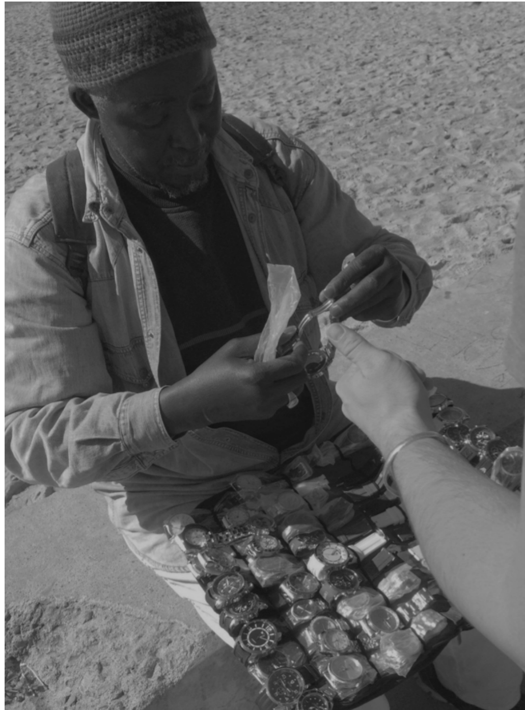
Quality watch vendor (A. Storch 2017)