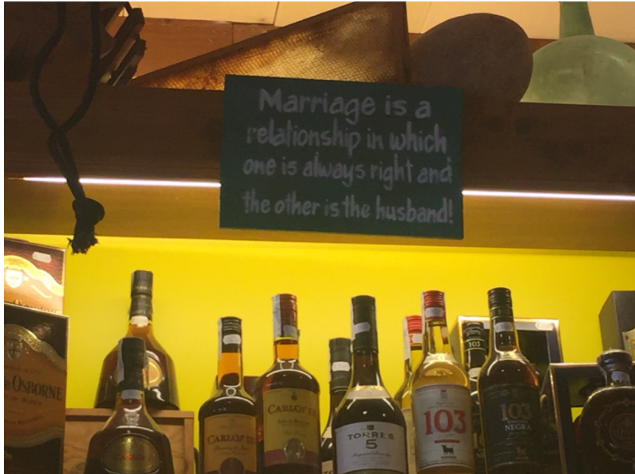
Statements and drinks