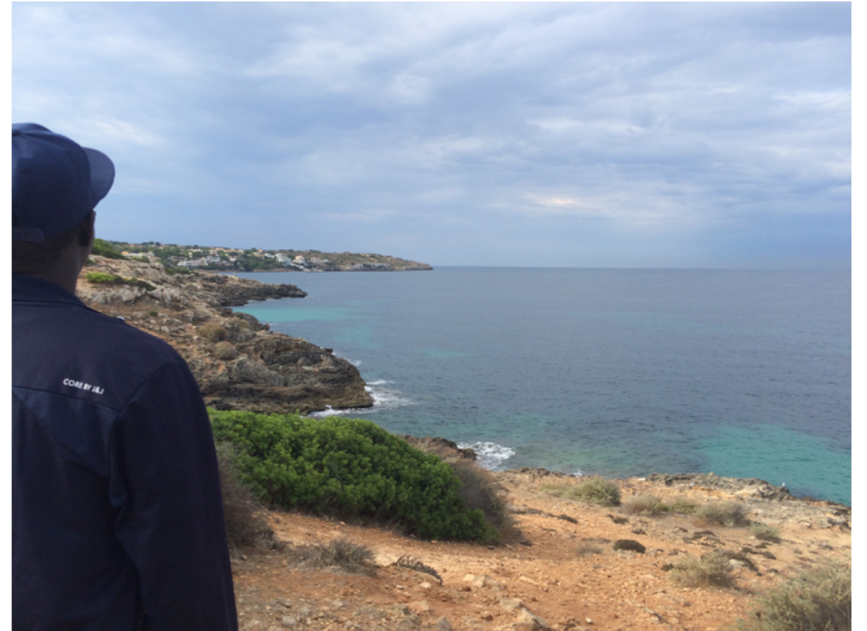
Favorite sight of a tourism worker (A. Storch 2016)