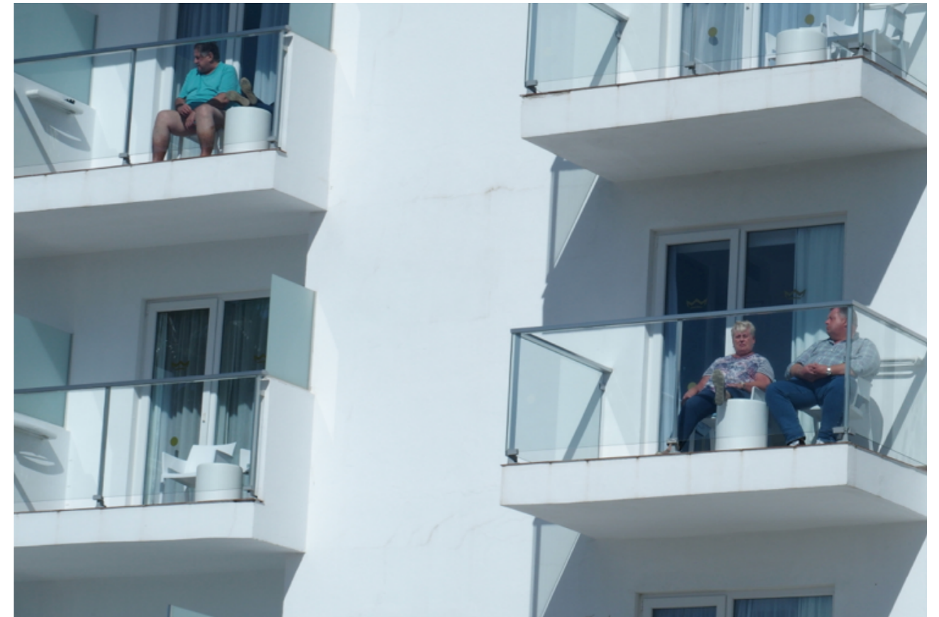
Breaking free in Mallorca (A. Mietzner 2017)