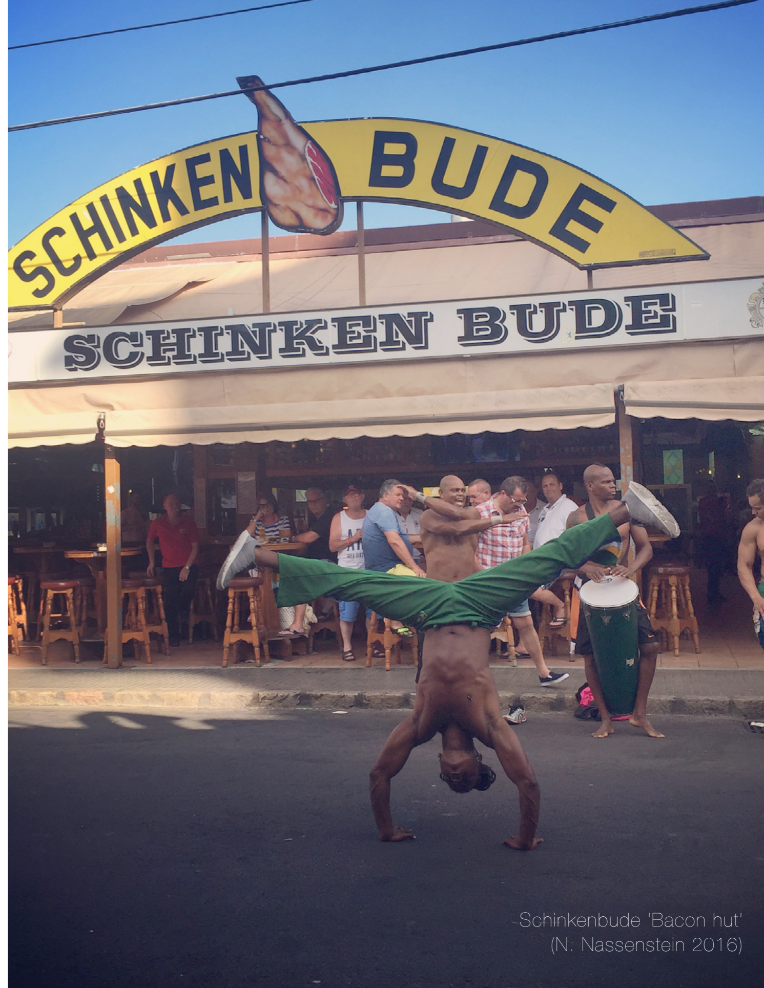
Schinkenbude 'Bacon hut' (N. Nassenstein 2016)