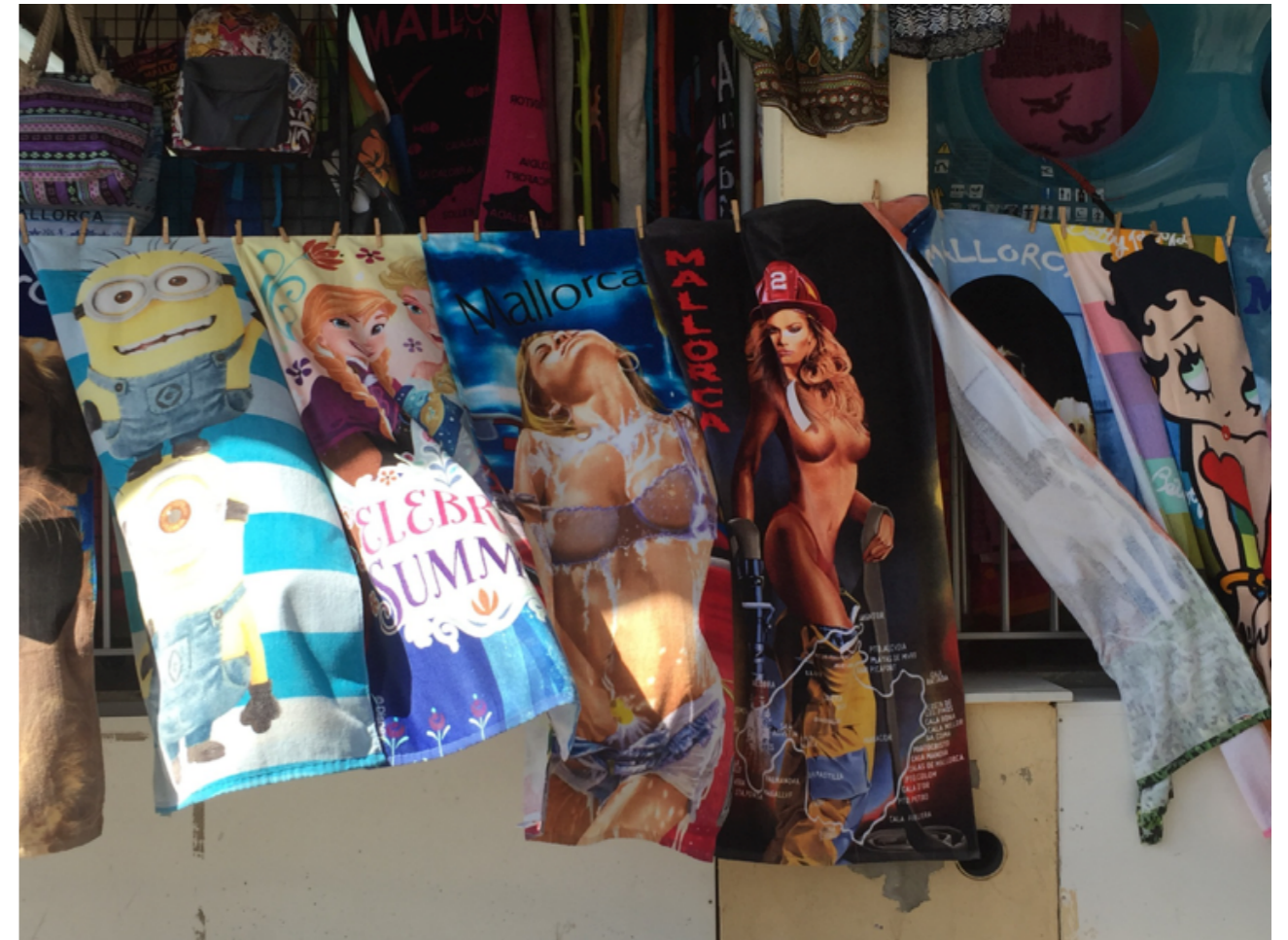
No age limit required (J. Traber 2016)