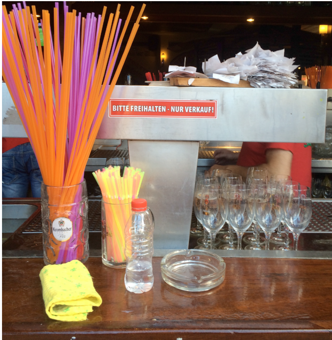
A display of emblematic things (A. Storch 2016)