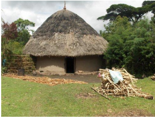
Kambaata house (Picture taken in the compound of the Handiso-family in Garba, 11/07/2007)