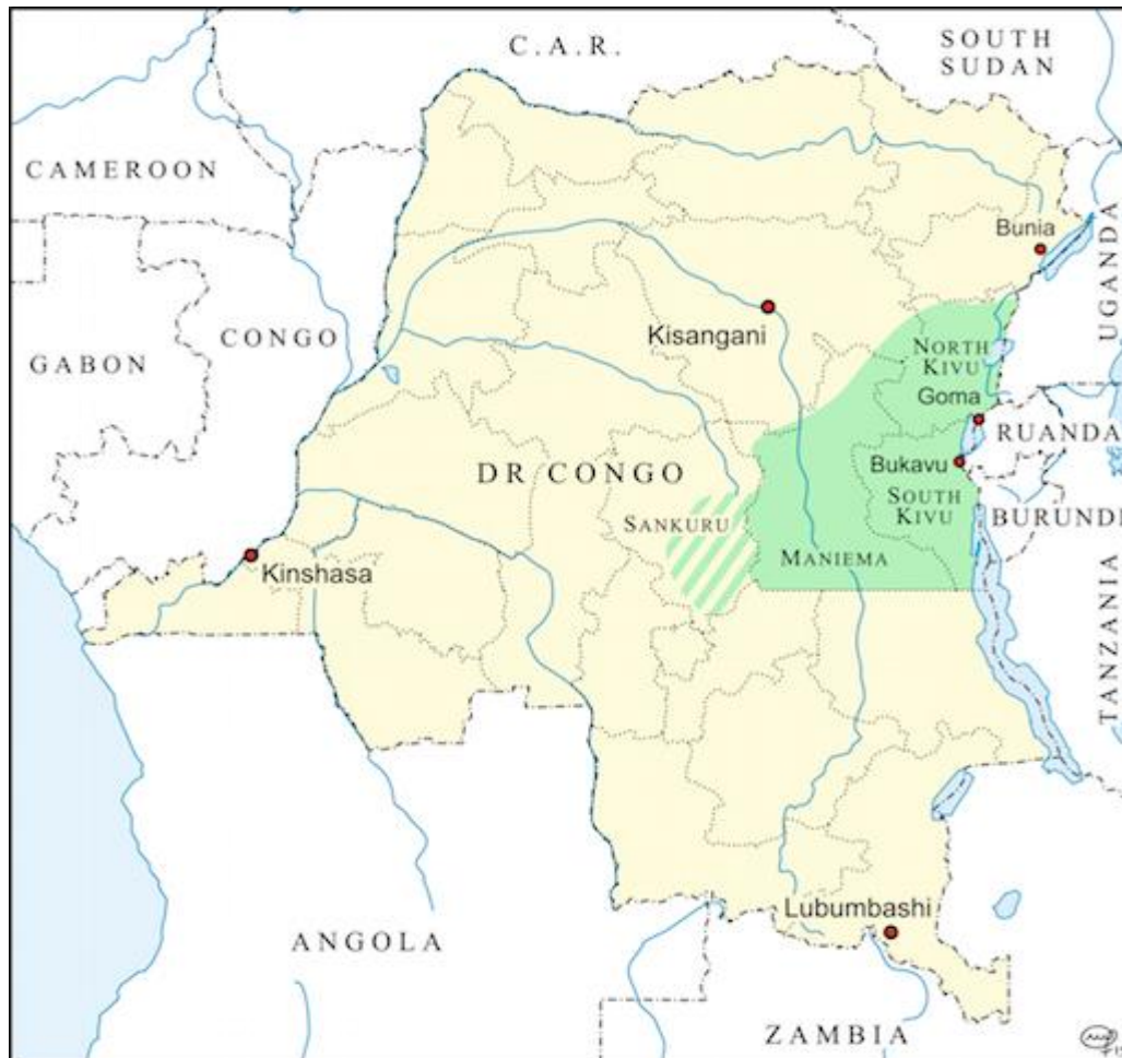
Map 1: Kivu Swahili and its approximate area of diffusion in DR Congo